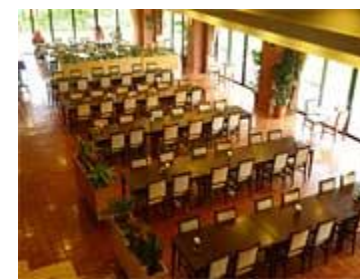
JICA OIC Restaurant