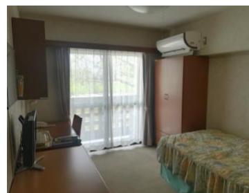
JICA Single Room