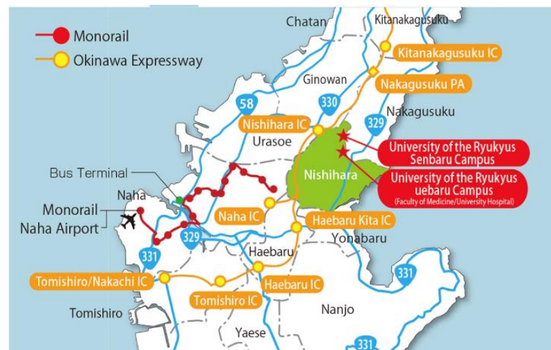
→ University of the Ryukyus Access Map